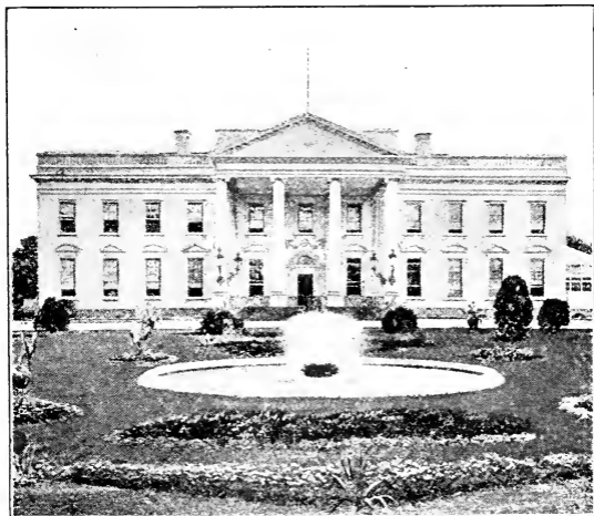
THE WHITE HOUSE AS LINCOLN ENTERED IT.